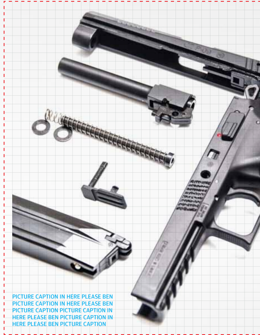
PICTURE CAPTION IN HERE PLEASE BEN PICTURE CAPTION IN HERE PLEASE BEN PICTURE CAPTION IN HERE PLEASE BEN PICTURE CAPTION IN HERE PLEASE BEN PICTURE CAPTION

Back to the texturing on the lower, it's an aggressive almost stipple effect that really does bite into the hand well giving a very positive and firm control of the gun, combined with the flattened feeling grip, the whole thing feels eminently pointable. Additionally grip sections are added to the forward portions of the frame to encourage and support an effective grip of the weapon.